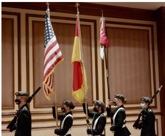
National Colors, 1 st Cavalry Division Flag, Delta Guidon carried by the Silverado High School Army Junior ROTC