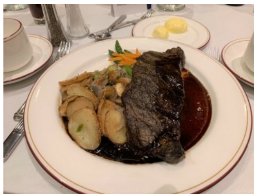
New York Strip Steak w/ Peppercorn Sauce, Lyonnaise Potatoes, Asparagus w/ shaved Carrots. (Chicken & Vegetarian meals were also very good.)