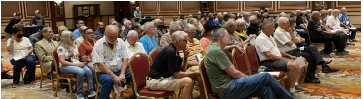
Memorial Service Attendance well over 100